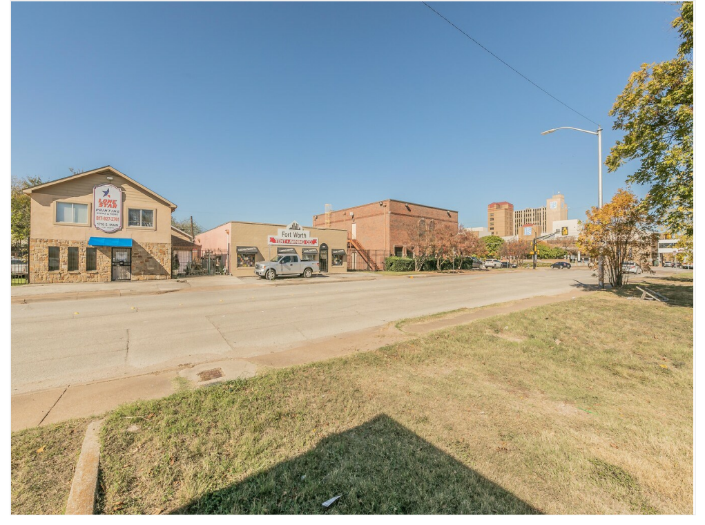
JPS Hospital across Allen Ave